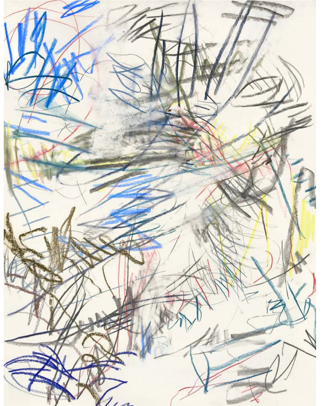
Untitled (cm.19.11) , 2019, crayon, color pencil, graphite on paper, 23 \frac{1}{2} x 18 inches