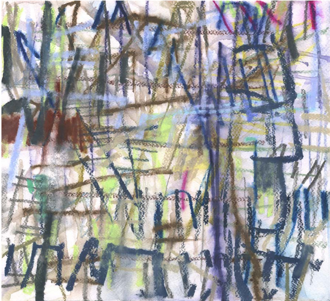
Untitled (cg.20.2) , 2020, crayon, pastel on paper, 11 \frac{1}{4} x 12 \frac{1}{4} inches