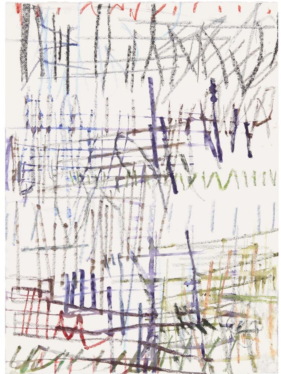
Untitled (cg.18.21) , 2018, crayon, colored pencil, pastel on paper, 30 x 22 inches