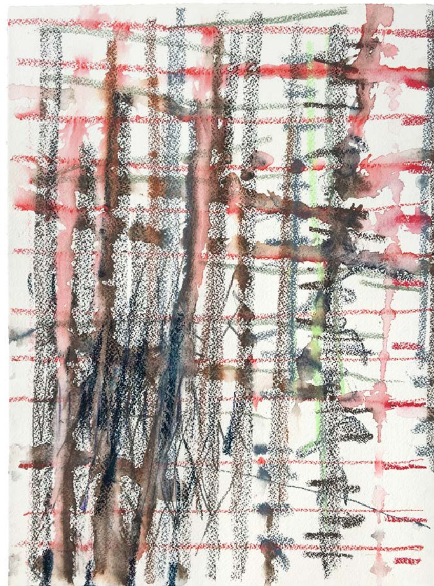
Untitled (cg.17.1), 2017, pastel, crayon, charcoal, graphite on paper, 15 x 11 inches