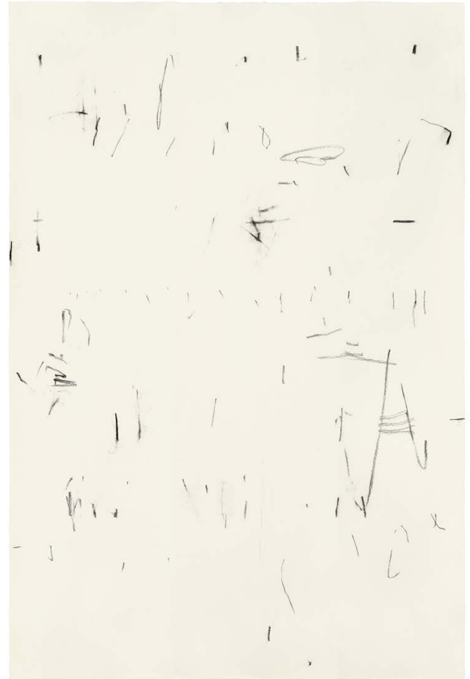
Untitled (chg.21.3), 2021, charcoal on paper, 47 3/4 x 32 inches