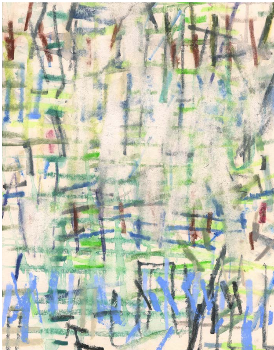
Untitled (cg.21.17) , 2021, pastel, crayon on paper, 11 5 / 8 x 9 inches