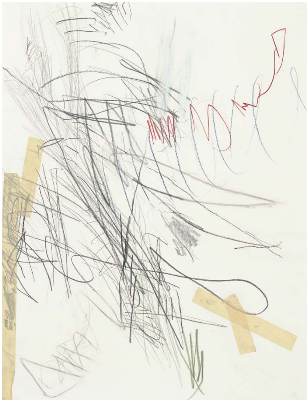
Untitled (cm.19.12) , 2019, crayon, graphite, colored pencil, tape on paper, 23 1/2 x 18 inches