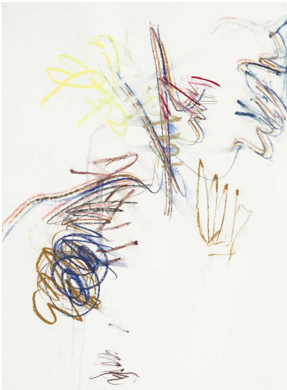
Untitled (cm.20.20) , 2020, crayon, colored pencil on paper, 30 x 22 inches