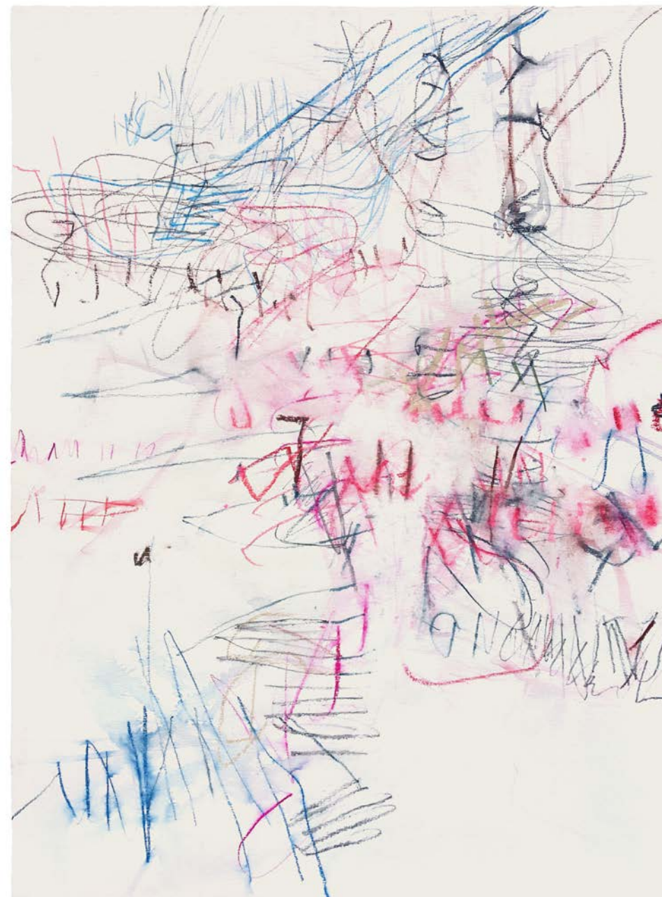
Untitled (cm.21.12) , 2021, crayon, pastel, colored pencil on paper, 30 x 22 inches