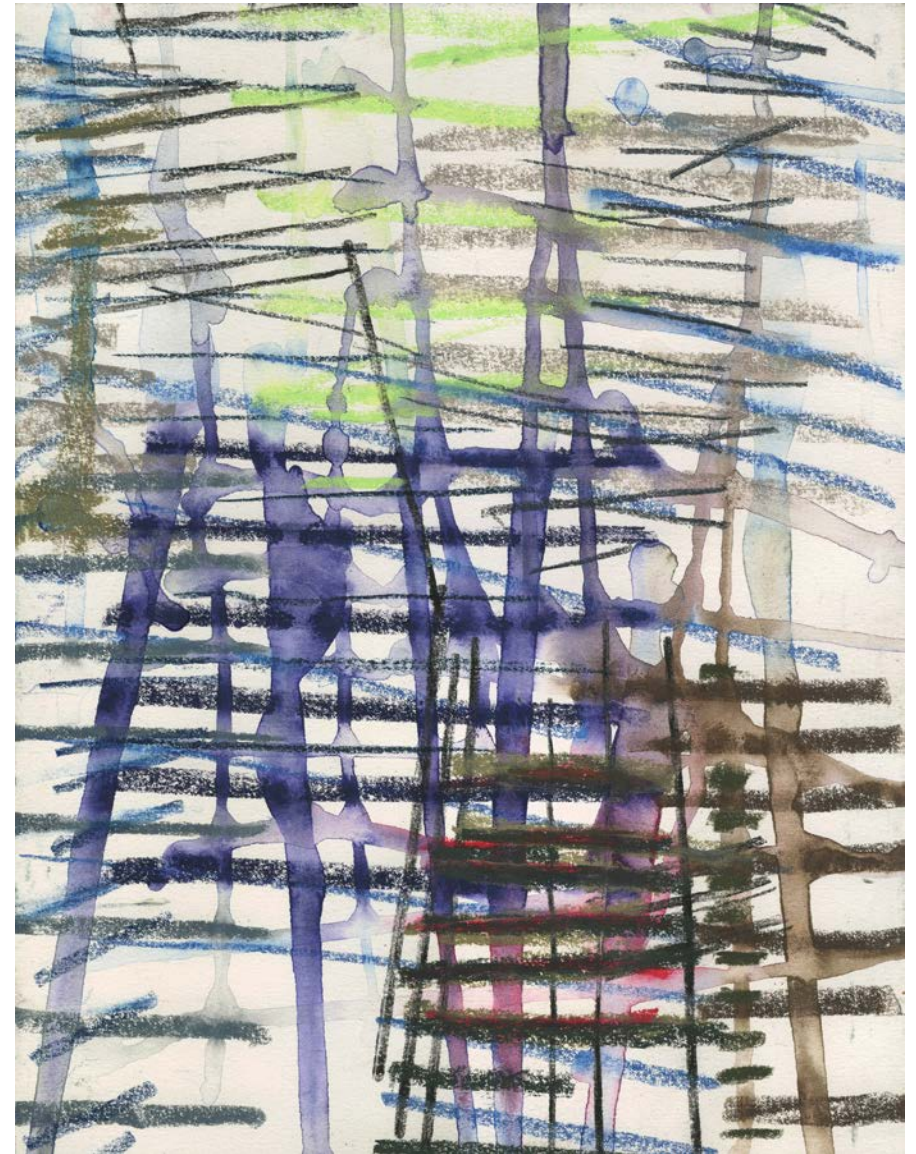
Untitled (cg.17.2) , 2017, pastel, crayon on paper, 11 7 / 8 x 9 inches