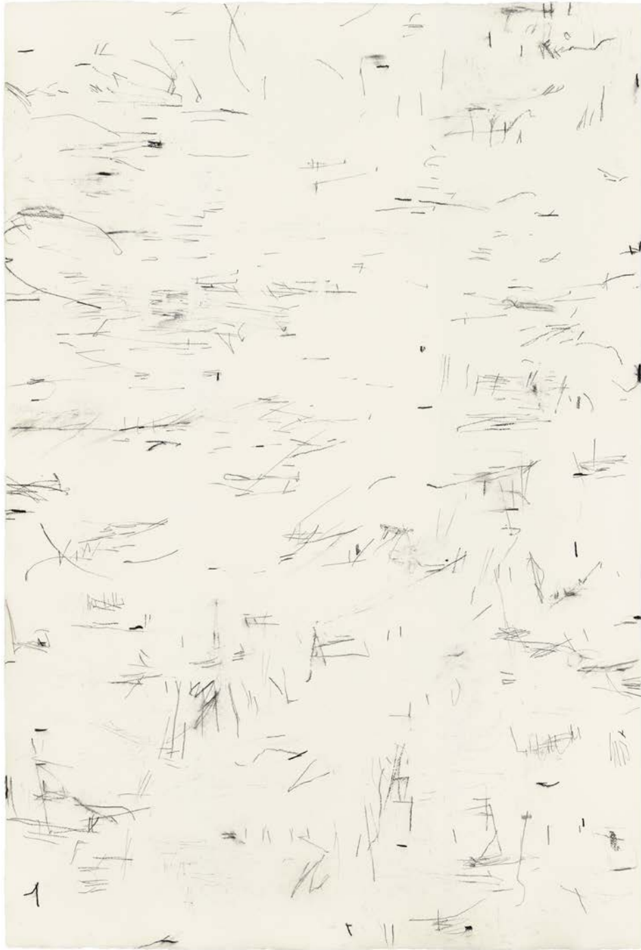
Untitled (chg.21.2), 2021, charcoal on paper, 47 3/4 x 32 inches