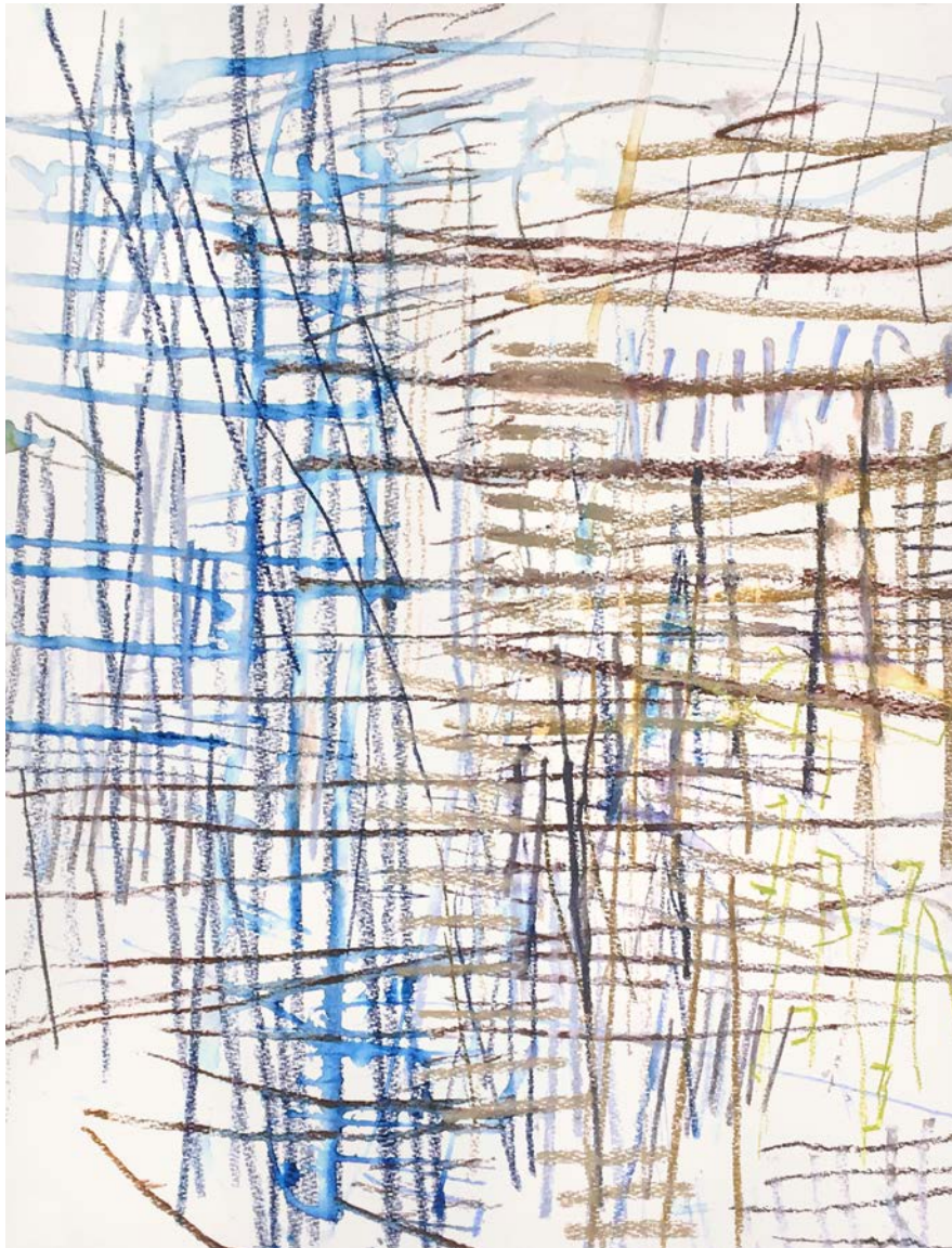
Untitled (cg.18.4) , 2018, pastel, pencil, crayon, conté on paper, 20 x 15 inches