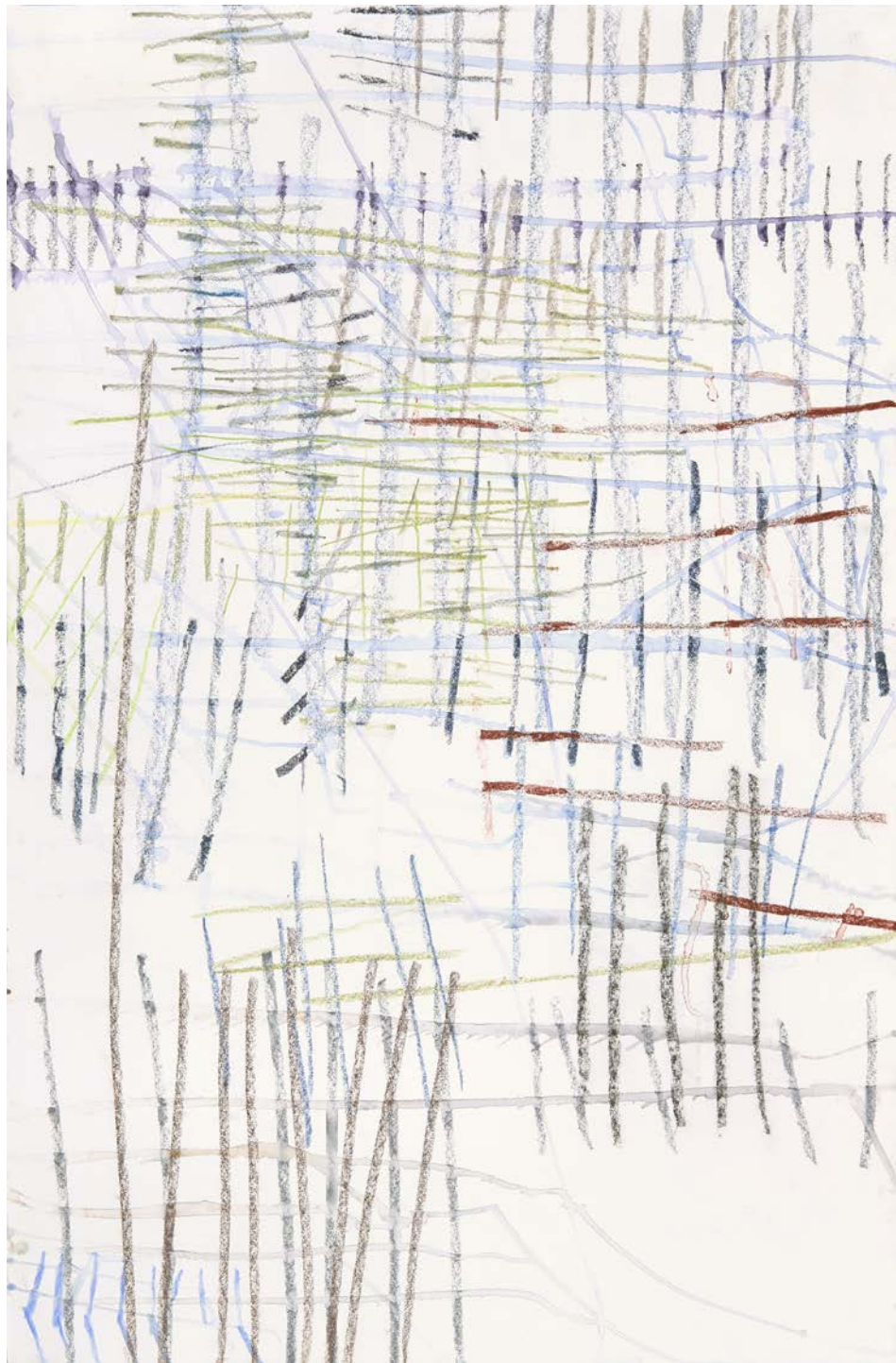
Untitled (cg.20.25), 2020, crayon, pastel on paper, 40 x 26 inches