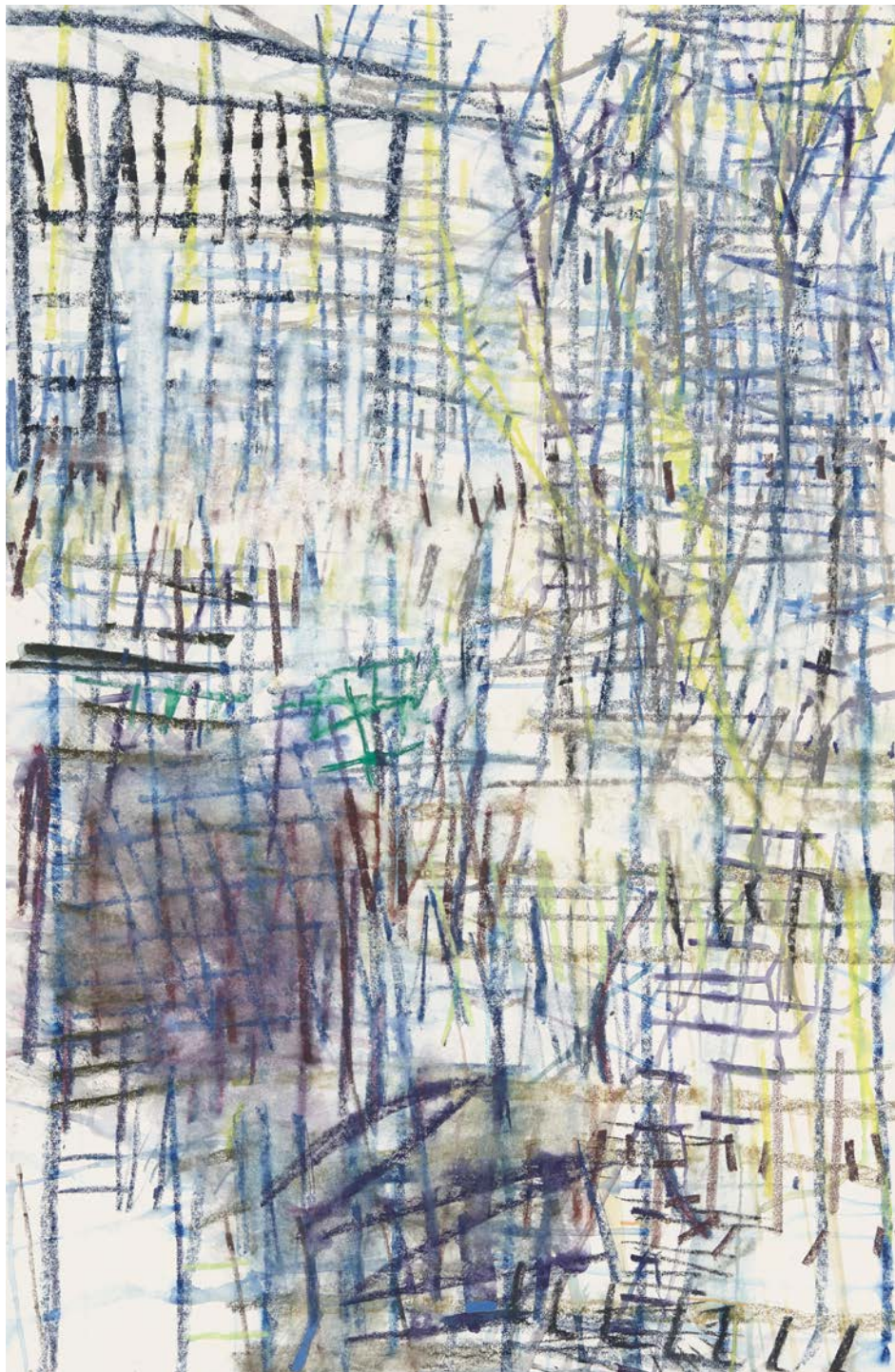
Untitled (cg.18.20) , 2018, crayon, pastel, blue tape on paper, 40 x 26 inches