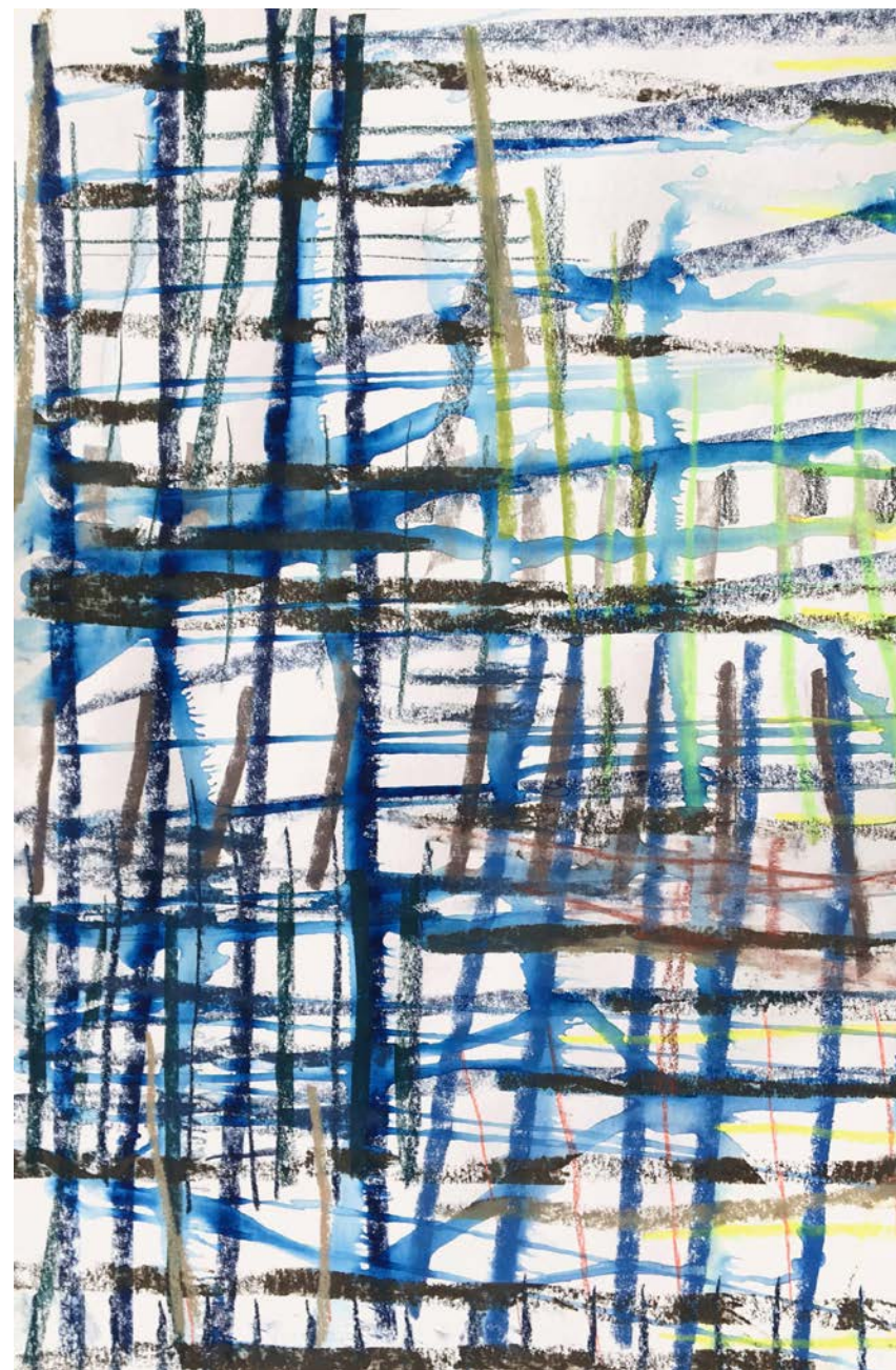
Untitled (cg.17.4) , 2017, pastel, pencil, crayon, conté on paper, 20 x 13 inches